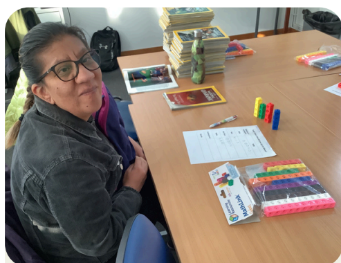
Maths and English