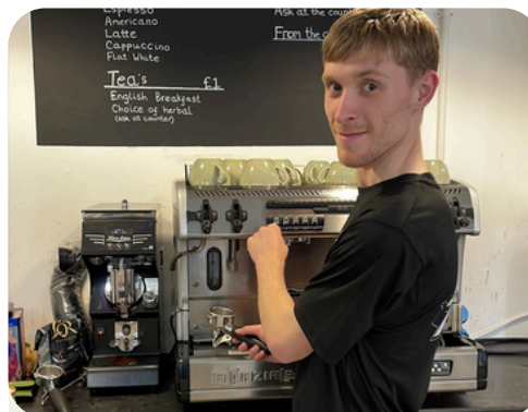
Working in our community café