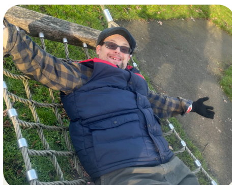
Health and wellbeing