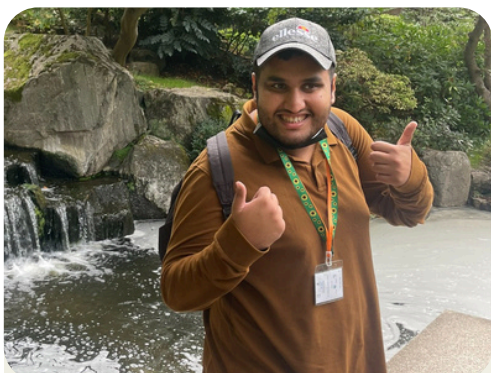
Out and About

Some classes help you to learn how to do things by yourself.