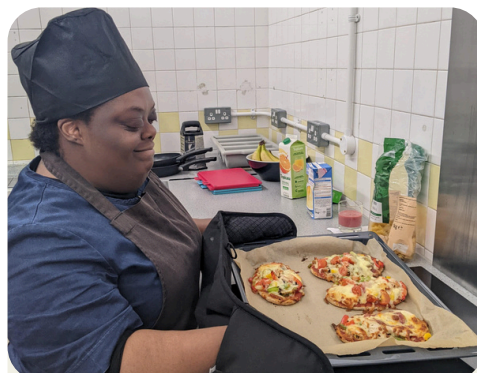
Home Cooking Skills