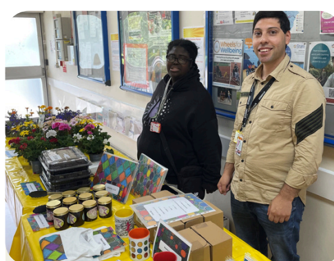
Steps into Employment