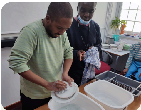
Independent Living Skills