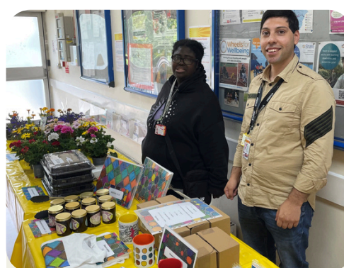
Steps into Employment