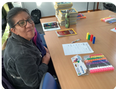
Maths and English